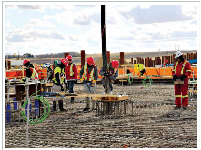
The completion of piling work and the building of concrete foundations are the focus of Winter construction activities.