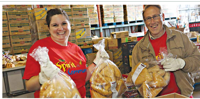
Helping out at the Food Bank.