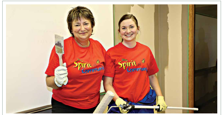
Painting at the United Way Office.