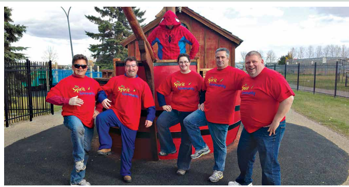
Our superheroes helped refurbish a pirate ship activity at KCS Association for early learning and special needs.