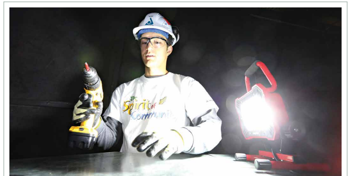
Constructing the haunted house for the Youth & Volunteer Centre of Red Deer’s annual fundraiser. This year the fun event raised more than $100,000 for the agency.